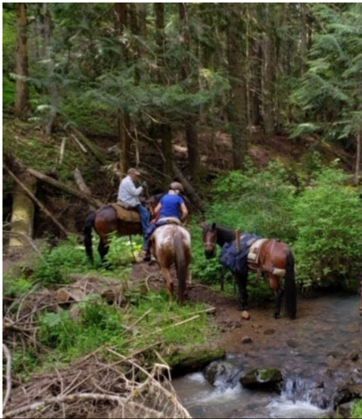
Nine PBCH members worked last Friday on the trails at Heyburn State Park south of Coeur d'Alene.